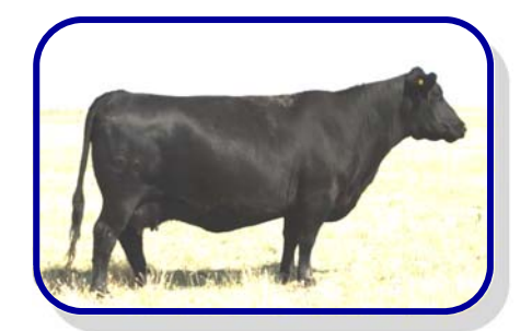
10-year-old, low-maintenance, PCC solar cows stay this fat even during a severe drought