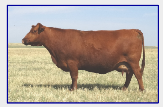
10-year-old, low-maintenance, 3 to 4-frame PCC cows stay this fat even during a severe drought — 30 days post calving.

We are light years ahead of nearly everyone else in this business. Sooner or later, all cow-calf producers will be forced to produce easy-fleshing, grass-efficient cows with extremely low maintenance requirements — or they will be forced out of business. Why not get a head start on everyone else? High-maintenance cattle will eventually go the way of the dinosaurs.